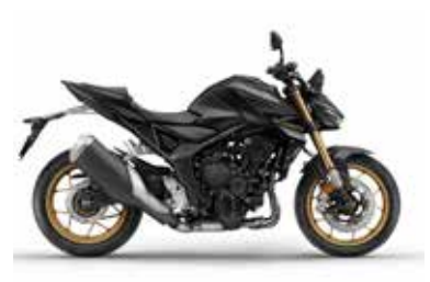
Mat Ballistic Black Metallic